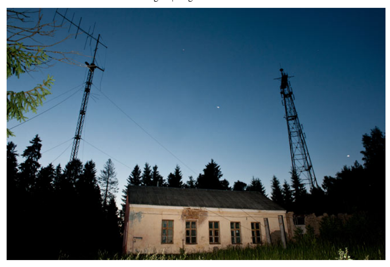
One of several abandoned structures near the radio tower in Povarovo.