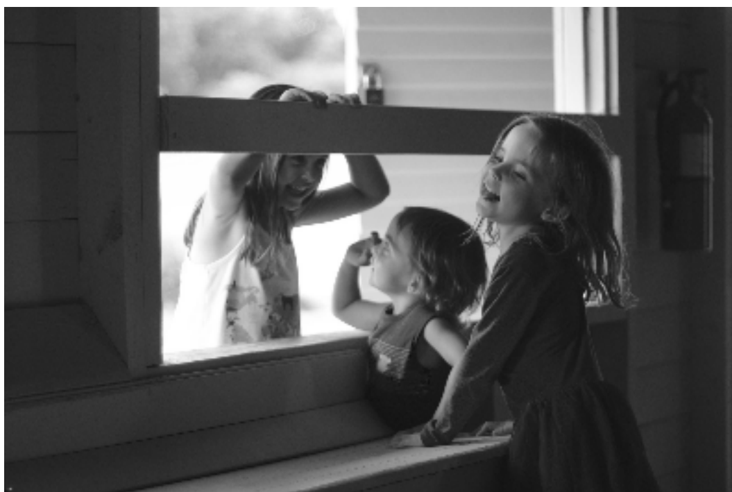
Given space kids can make a game out of anything, even an open window.