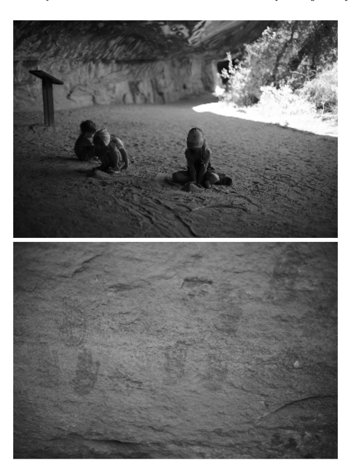
Olivia is still a little disturbed that we only hike in the desert, but she came around at the memtion of ladders.