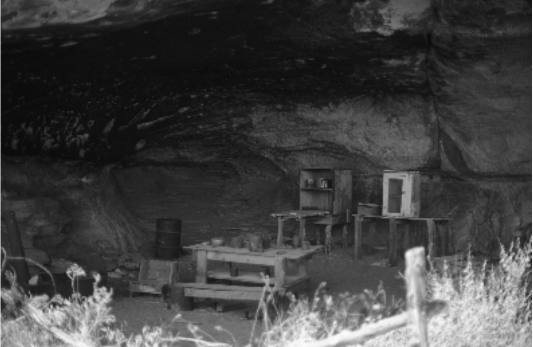
An old cattle drive stopover, still furnished.