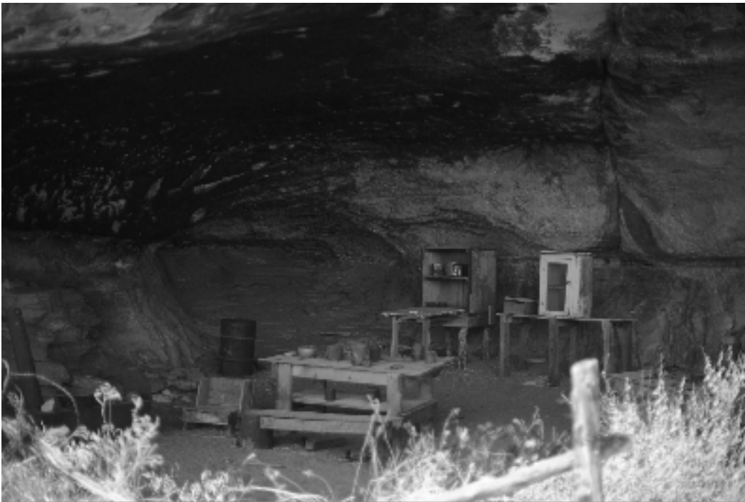
An old cattle drive stopover, still furnished.