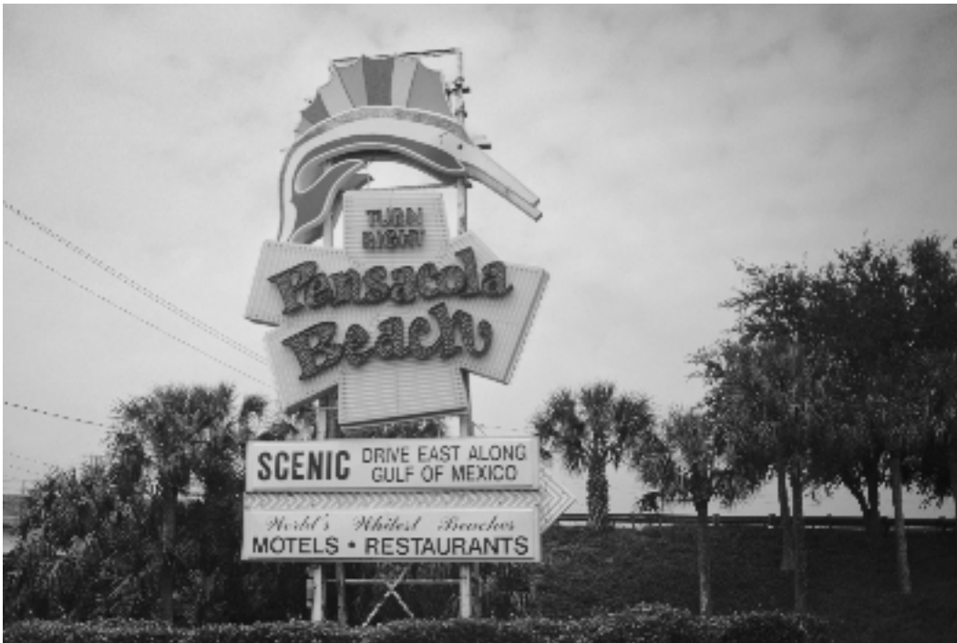
Florida, where the 70s never stopped.

I am, and will continue to be, an advocate of taking the back roads. However, there are exceptions and Florida's 98 — not really a back road, but the only option other than I10 — is a horrid disaster of a road. It was so bad I'm not even going to describe it. I'll just say that if I had it to do over again I'd take I10. Although I don't know, Florida drivers are so consistently bad I'm not sure I'd want to see them going over 60. I've been to 45 states and Florida drivers are without question and by a very large margin consistently the worst drivers I've ever had the misfortune to drive among. I've also never seen so much garbage hurled from moving cars. Stay classy Florida.