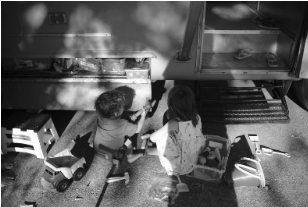
Not sure where they got the idea, but fixing the bus is one of their favorite games now.