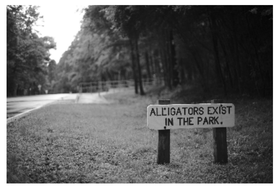
Yes, but are they happy? Fulfilled? Satisfied?

Then we do something I've been pondering ever since Taylor and Beth served us combread waffles — would chocolate cake waffles work? Yes, yes it would<sup>1</sup>