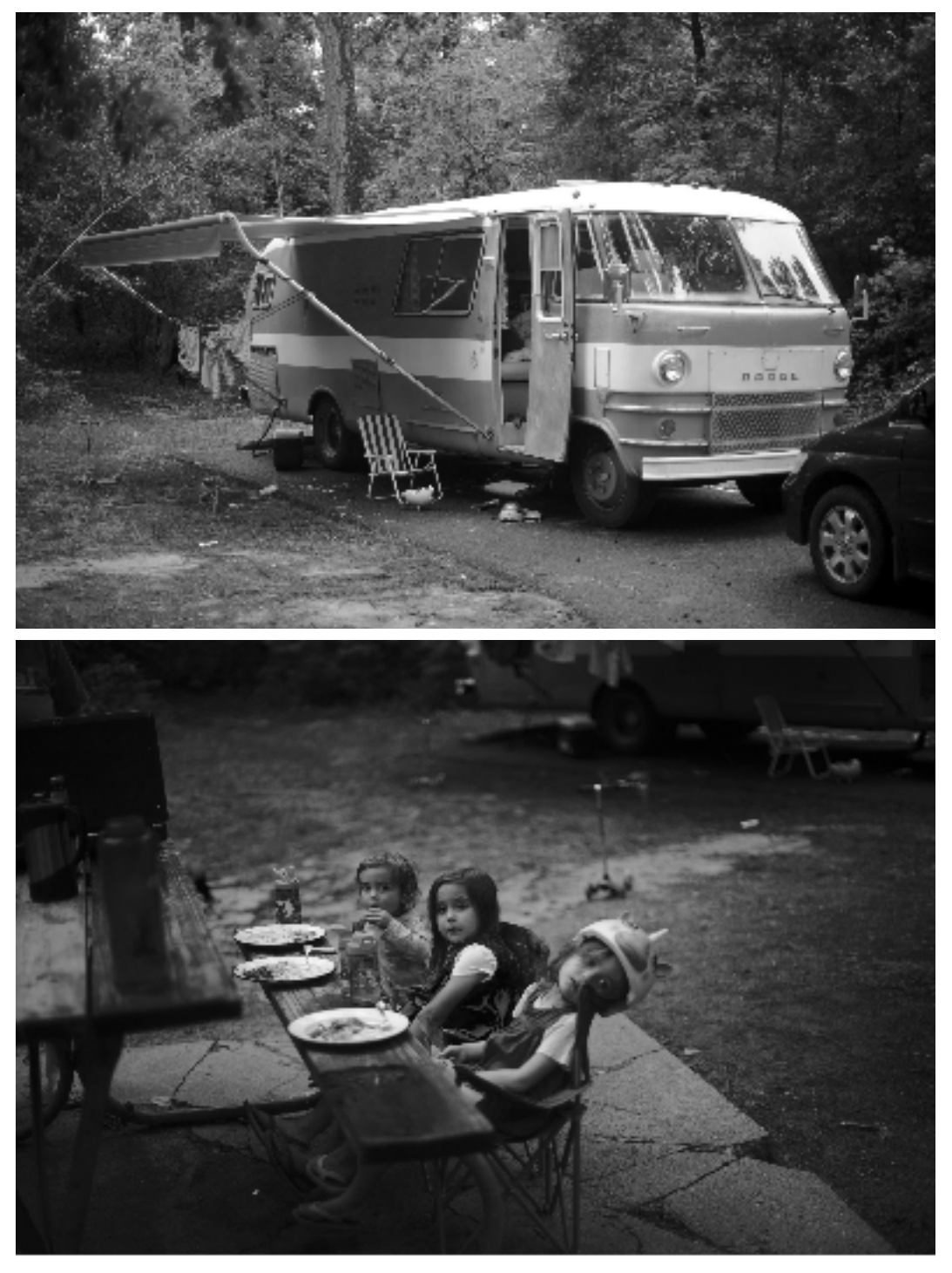
Not every dinner is enthusiastically received.

Our oven doesn't work, so actual chocolate cake or cupcakes or whatever aren't possible. I believe something is wrong with the thermostat, though I haven't really spent much time investigating it yet. <u>←</u>