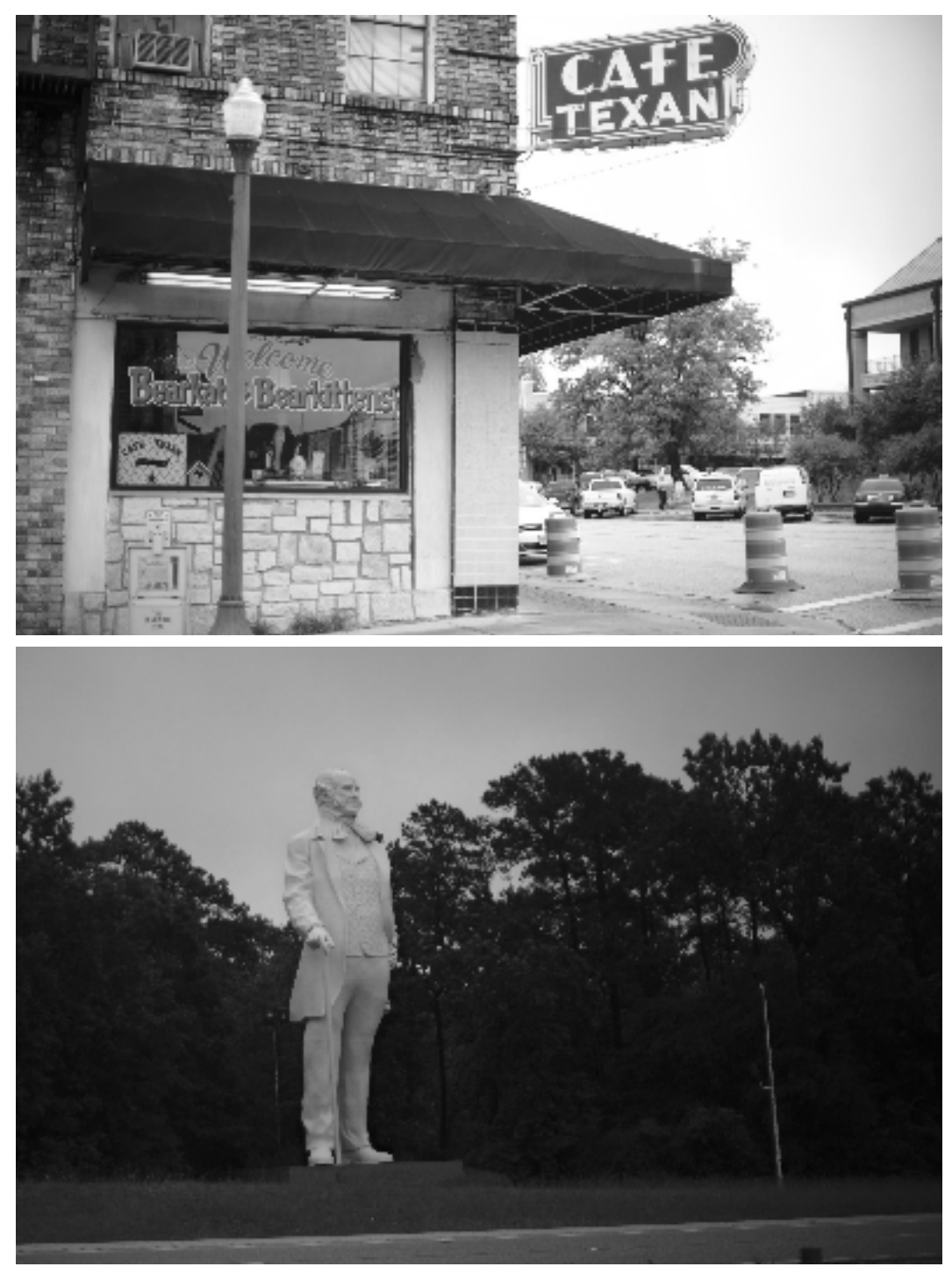
First Lenin statue I had seen since Eastern Europe.