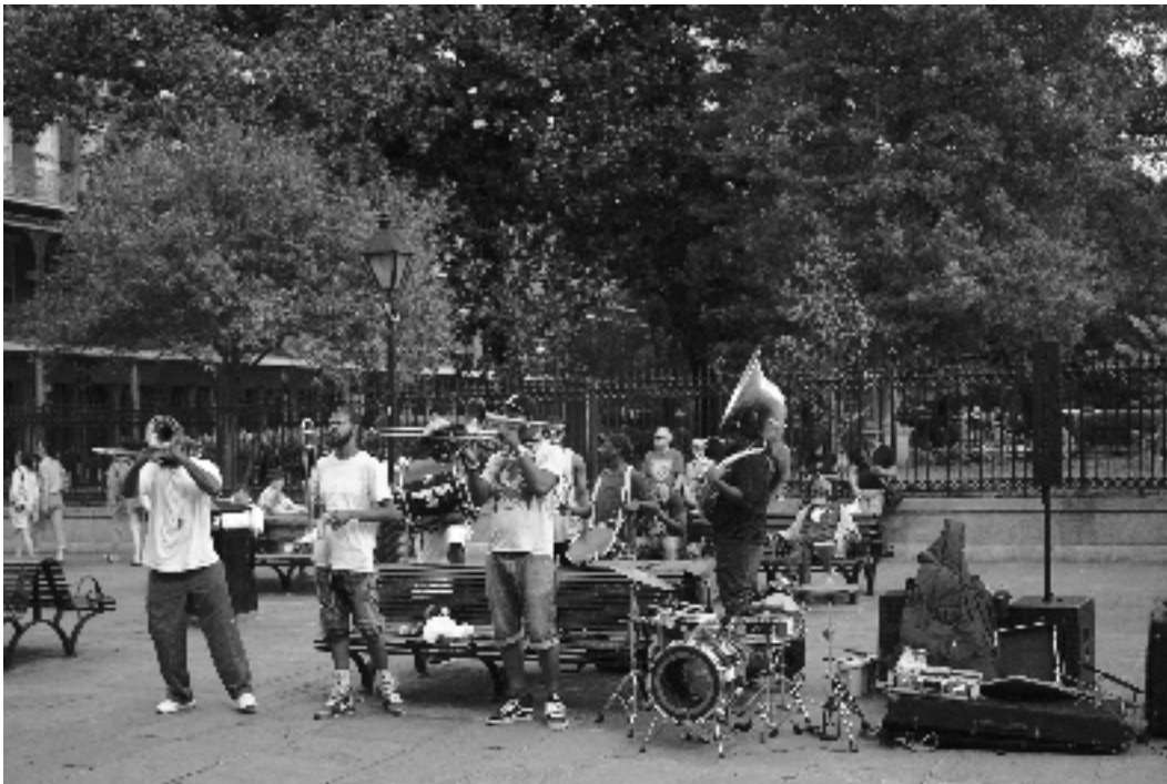
The Free Spirit Brass Band was pretty damn good. You can listen to them on youtube .