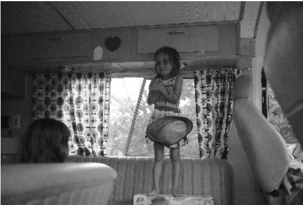
The hat is full of little scraps of paper with messages written on them.