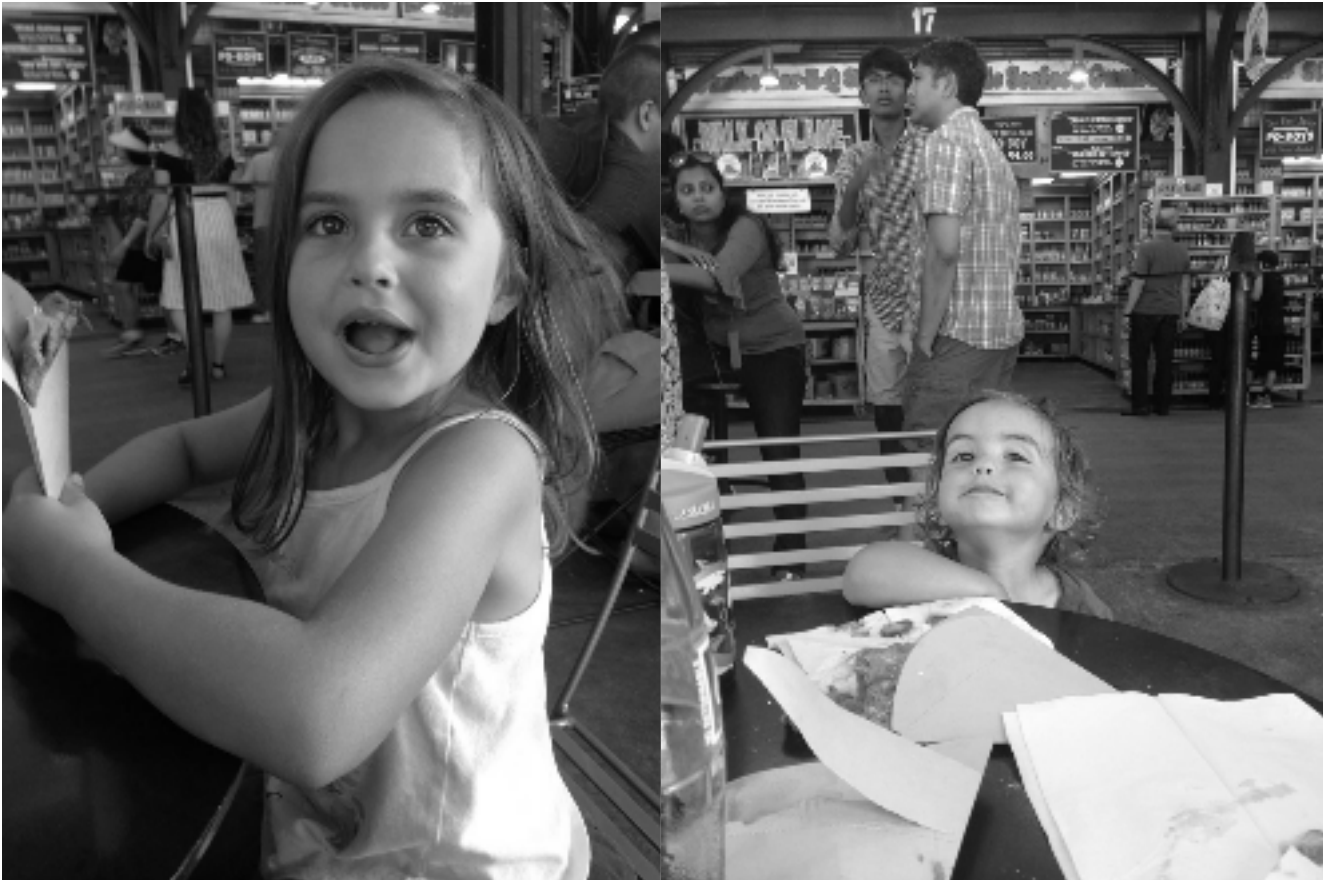
crepes in the french market, new orleans.

The New Orleans we found this time was all over the map. Along with the French Quarter, City Park