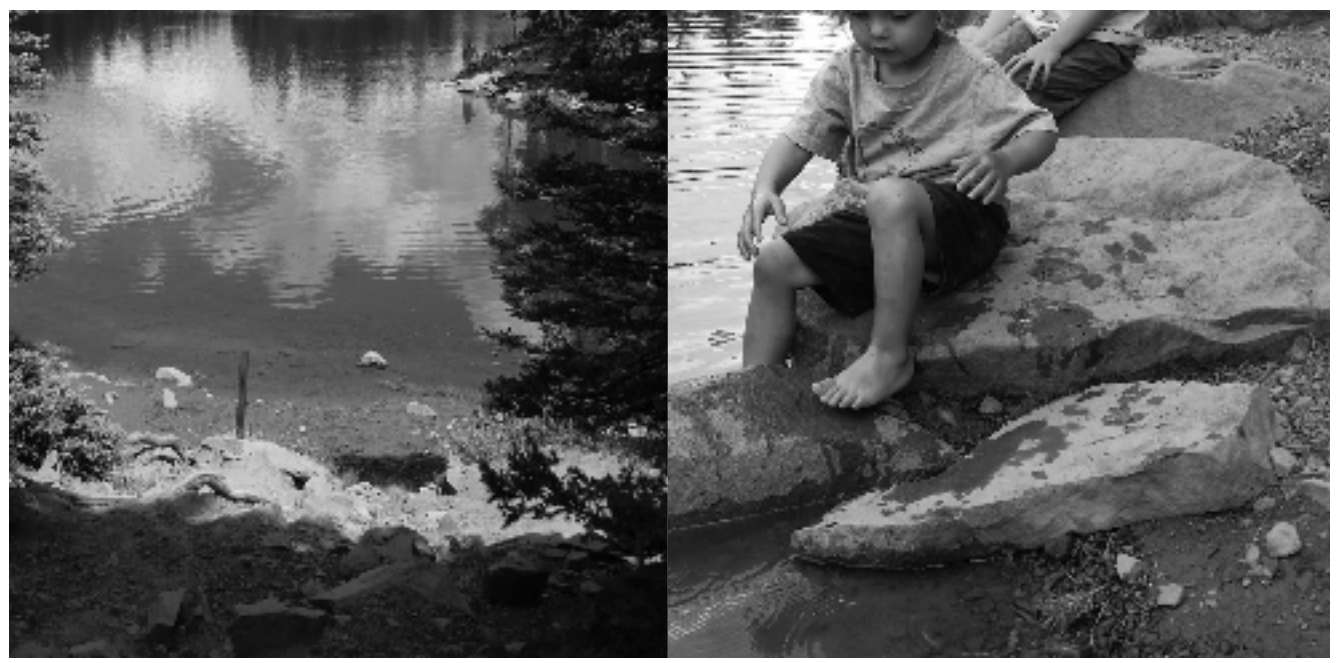
The name comes from a large black bear that was

causing a lot of havoc back in the early 1900s. An early forest ranger set a trap for it and the next day he went to retrieve the trap but it was gone. He tracked the bear and trap to the middle of the lake. The bear was so big that it had dragged the trap cross-country several miles before dying in the lake. The story serves as a reminder that the pre-Aldo Leopold forest service was not noted for it's ecological outlook. Arguably, neither is the post-Aldo Leopold forest service.