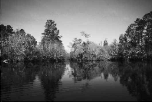
Despite by best efforts and stealthiest paddling we never got anywhere near a gator, but I did manage to grab a feather left behind by one of the wood ducks.