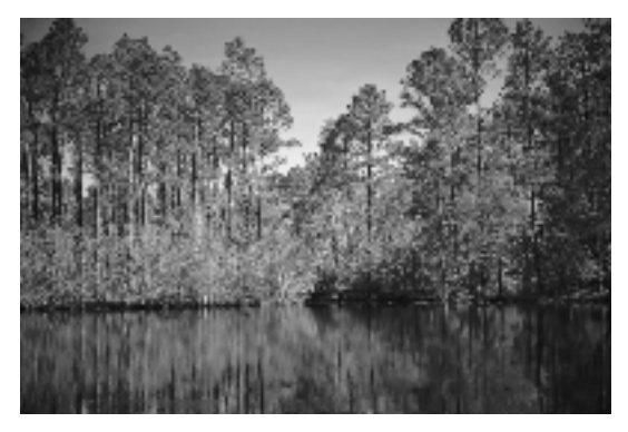
And there was no shortage of other animals around, sleek blue-tailed five-lined skinks, green anoles, carolina wrens, tiny pig frogs, great egrets, snowy egrets, great blue herons, and a sharp shinned hawk