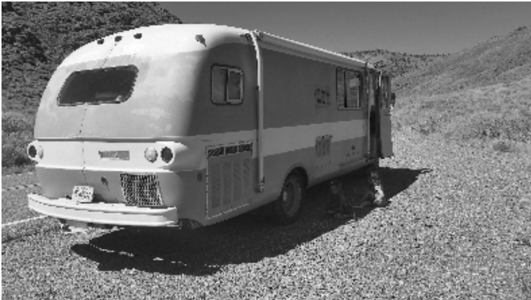
Overheating. Again.

We said goodbye and hit the road again. Climbing the third pass I started to smell that sweet smell of radiator fluid and pulled into the next turn out. The bus sat boiling over for a bit, maybe a quart, and then it stopped. We climbed out to sit for a while and consider our options. Except that there weren't any really. With no cell reception to call a tow truck, no real way to turn around, and no where else to go even if we did, we had to get over the pass. At one point an older gentleman on a Harley stopped at see if we were okay. We chatted for a bit and he told us the top of the pass was only about four or five miles ahead, which was encouraging.