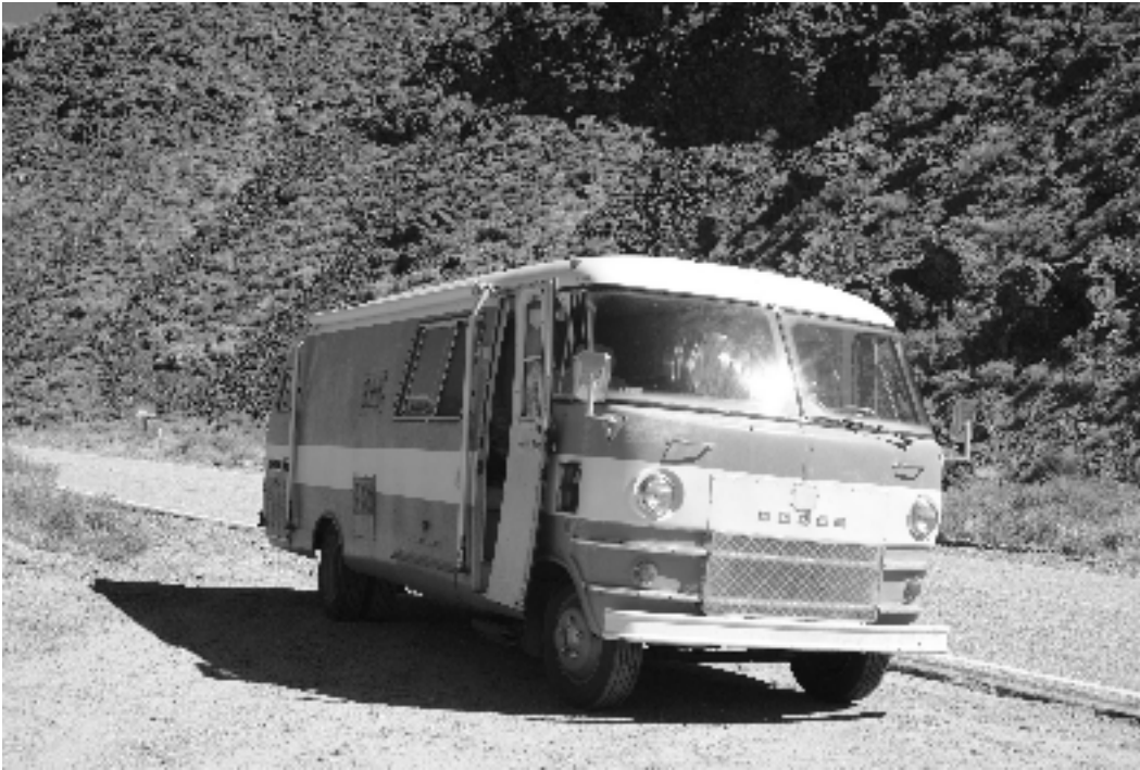
Resting the brakes.

The downhill grade on the other side of the pass was 10 percent all the way down which had us stopping to rest the brakes four or five times, but eventually, around dinner time, we finally made it to Big Pine.