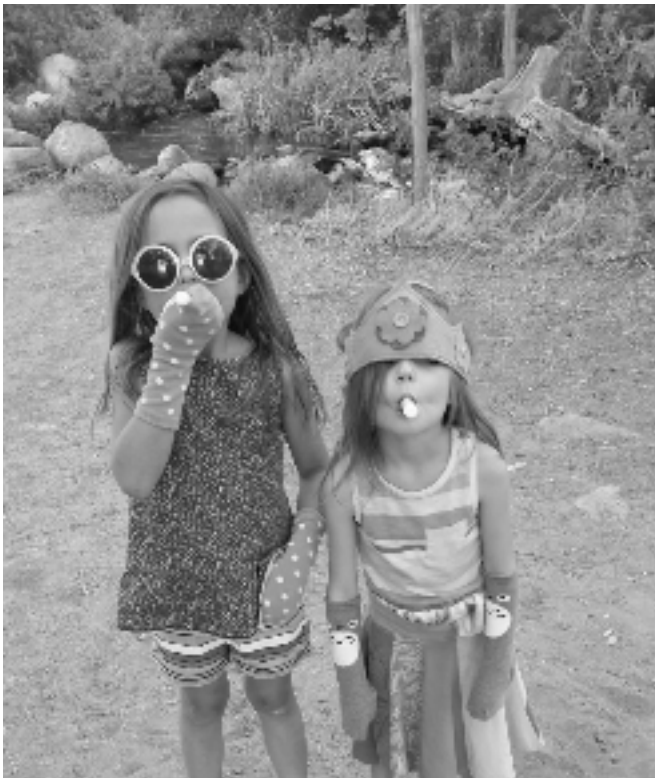
Snorkel costumes. We really need to get back to the beach.