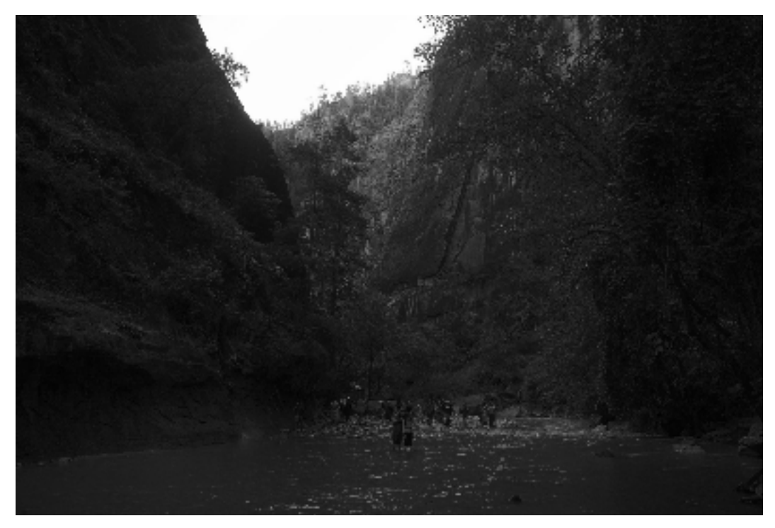
The narrows, just me and 300 of my closest friends.

The last day we were there I took the bus up to the end of the canyon and speed hiked to the entrance to the narrows (3 miles round trip in 45 minutes, not bad for an old man). On the way back it finally hit me what irritates me about Zion — my kids will never get to experience the place as I did.