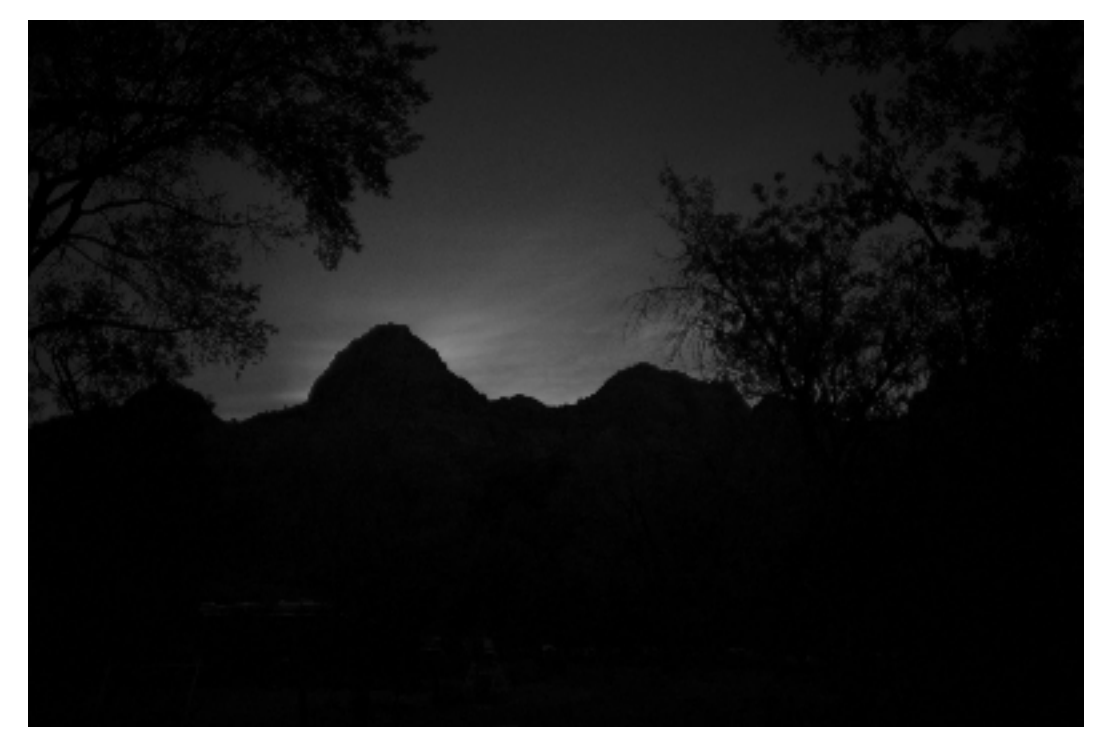
Sunrise from the campground line.

show up on a Friday and get a campsite, you'll need to get in line at about 5:00 AM even in the off season to even think about getting a campsite. Which, after spending a night in the nearby hotel, I did. The longer I sat in line, the more irritated I got. About what I'm not sure — too many people? That's sort of a strange thing to be irritated about.